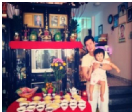
Figure 4. Ancestor worship ritual in celebrating rite of one-year old child