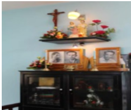
Figure 2. Ancestral altar and Christian altar

In seasonal rituals, holiday rites, especially death anniversary day every year, the members of the patrilineal descent group gather and perform ritual. Among the preparation, making offerings of incense, or meal (rice, meat, fruit) at the altar or gravesite is most important. It is based on the belief that the deceased ancestors, would come back home and have meal with the family as usual. And for taking care of the life after death, burning paper money, paper clothes, for ancestors is still widely practiced.