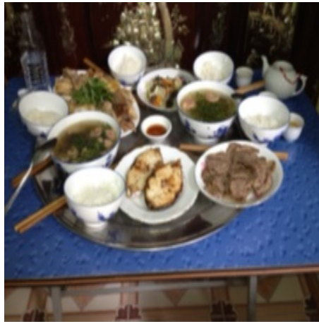
Figure 5. The food offering for ancestor