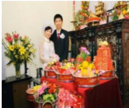
Figure 3. Ancestor worship ritual in wedding

In this case of performing the death anniversary ritual of the dead father of husband, Mrs. A (65 years old) and her daughter-in-law were in charge of preparing the offerings (flowers, foods for death ancestors, food for the relatives, etc). They begin to cook from the day before and finish at about 11:00 am. The husband of Mrs.A laid the offerings on the ancestral altar. He lit the incense to invite the death ancestor to come home for having a meal with the family and the relatives (of the husband) came and offered incense and offerings (fruits) on the ancestral altar to pray to the dead ancestor. After that, they shared the offerings of food given to the dead father, had meal, and talked together. Finally, the offerings of fruits were shared with all the participants. It is thought that they could share the good luck, protection from their ancestors together. The practice of the ancestors worship ritual is expressed through some reference Figures 3, 4, 5 as follow.