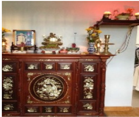
Figure 1. Ancestral altar and Buddhist altar (Bao 2012)

Generally, the worship rituals are performed in the ancestral altar in household or at the graveside of deceased ancestor outside. In my research, in spite of their own religions, in almost all households, the ancestral altars are established and the rituals are practiced as tradition basically (Figure 1 & 2).